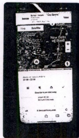
114.81 KB 10:21:00 PM IST