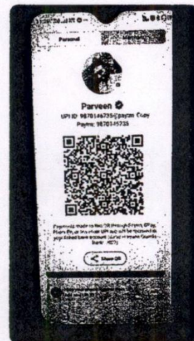
107.75 KB 11:26:37 PM IST